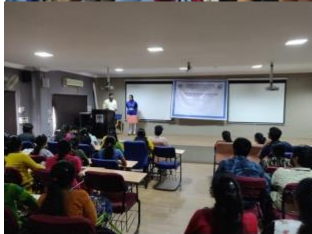
IEEE Student Members during the meeting